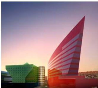
The Red Building West Hollywood