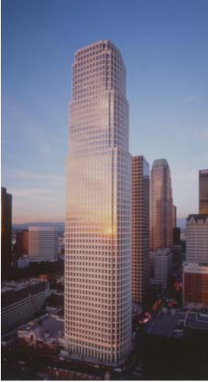
777 Tower Los Angeles