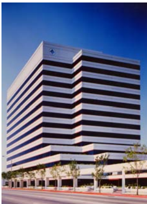
First Federal Bank Santa Monica