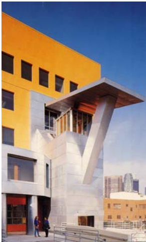
Loyola Law School Los Angeles